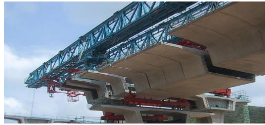
Fig 4 Precast bridge construction method

Precast bridge construction method has been divided into three parts namely I beams and super Tee, Segmental and full span. Precast construction means that bridge members or segments are prefabricated at a location different from the site, transported to the site, and installed there. Construction with precast segments has several advantages in comparison with cast-in-place segmental bridges. Casting of the segments can be performed under controlled, plant-like conditions at the pre casting yard. This industrialized process allows easy quality control of segments prior to placement in the superstructure and saves money through reuse of the pre casting formwork.