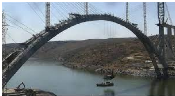
Fig 7 Arch bridge construction method.