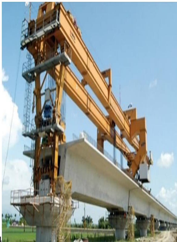
Fig 2FSM (Full Span Method)

the whole bridge span in the casting yard and transporting the whole span with a specially designed multi-axle Tyre Trolley to the bridge site.