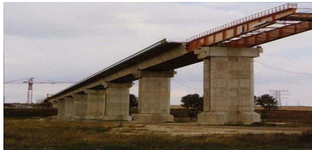
Fig 6 Incremental Launching bridge construction method

Incremental launch is a method in civil engineering of building a complete bridge deck from one abutment of the bridge only, manufacturing the superstructure of the bridge by sections to the other side. In current applications, the method is highly mechanised and uses pre-stressed concrete. Incremental launching construction of 50 -60m spans with half-span segments is typically based on weekly segment cycles and by-weekly span cycles with one shift per day.